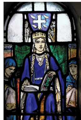
St Margaret of Scotland

Adoration of the Most Blessed Sacrament: Friday 5pm -7pm Sacrament of Confession & Reconciliation is available after Mass by request Holy Water can be collected from the Sacristy after Mass